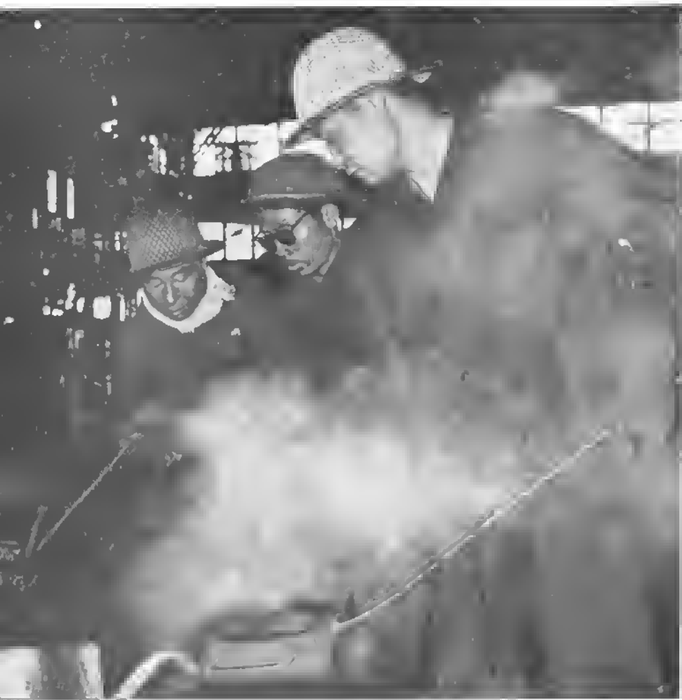
Leading cadres take part in collective labour in the shop every day.

factor in the campaign is the mass movement to study and apply Mao Tsetung Thought in a living way. Wall newspapers everywhere are filled with workers' articles spearheading their attack on Liu Shao-chi's counter-revolutionary revisionist line. Side by side with the workers, leading cadres work at the converters, blast furnaces and rolling mills in the high temperatures to help achieve high output and quality.